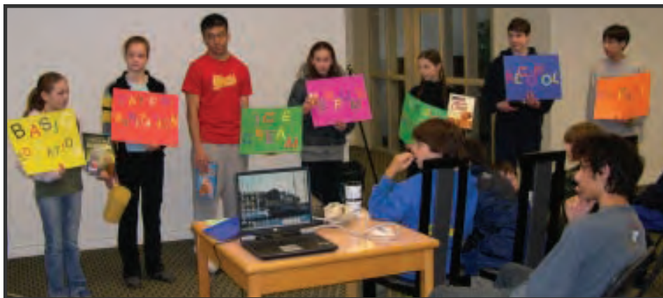
Members of Immaculate Conception Parish in Vancouver during their annual 25 hour fast to raise funds for their sister parish St. Vincent de Paul in Hatighisa, Indiavancouver

On March 25 th , 50 youths and young adults from Immaculate Conception Parish Vancouver gathered for their 4 th Annual 25 Hour Fast. During the event not only did they raise some much needed funds for their sister parish, St. Vincent de Paul, in Hatighisa, India, but they also questioned some of the unfair practices in the global distribution of resources by evaluating our individual and societal spending priorities. Have you ever thought about what you would do if you had a million dollars to spend? Our youths certainly had some creative answers!