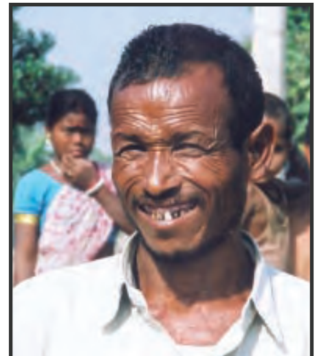
Stonebreakers live and work by the banks of the Balason River, Matigara

Support for purchase and repair of a building in central Lviv for the pastoral care and service to Ukrainian migrants and foreign refugees.