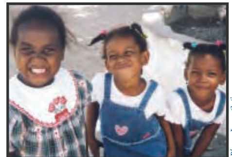
Twin girls and their young friend from St. Anne's Daycare in Kingston, Jamaica make faces at the camera