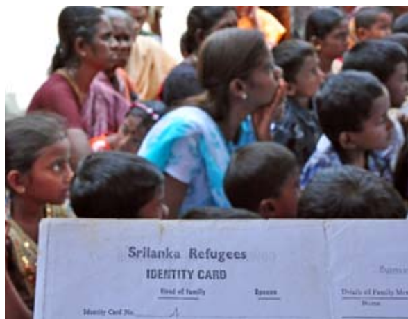
Sri Lankan refugees in a camp in Tamil Nadu, southern India

“In the world you will have hardship but be courageous: I have conquered the world.” – Jn 16:33