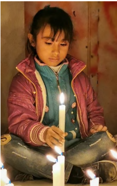
Education for peace program