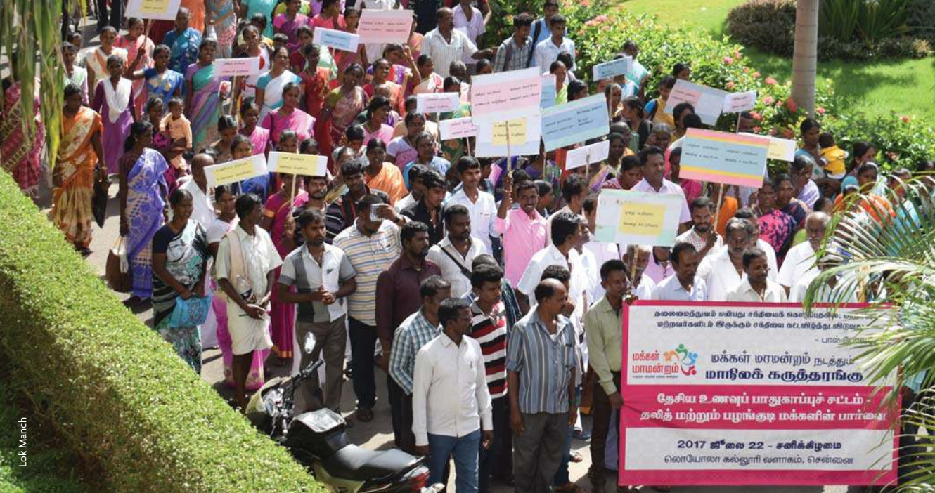
Lok Manch demonstration in India for the right to food under the National Food Security Act.

70 Saint Mary Street Toronto, ON M5S 1J3 Tel: +1 416 465 1824 Toll free: 1 800 448 2148 Email: cji@jesuits.ca www.canadianjesuitsinternational.ca www.facebook.com/ canadianjesuitsinternational instagram.com/ canadianjesuitsinternational twitter.com/weareCJI