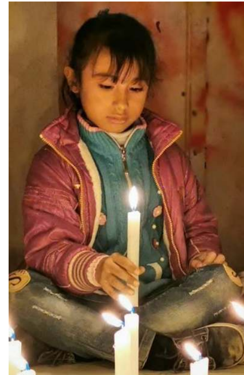
Education for peace program