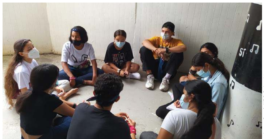
📷 Youth at a workshop of the Ignatian Youth Network in Barrancabermeja, Colombia discuss issues young people face in the area.