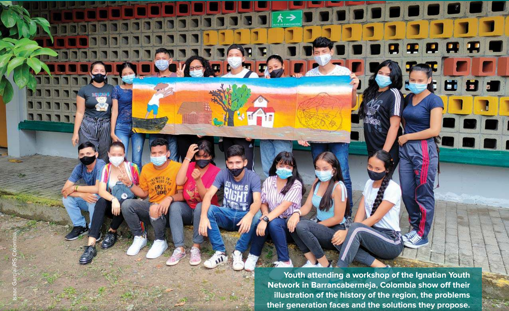
Youth attending a workshop of the Ignatian Youth Network in Barrancabermeja, Colombia show off their illustration of the history of the region, the problems their generation faces and the solutions they propose.