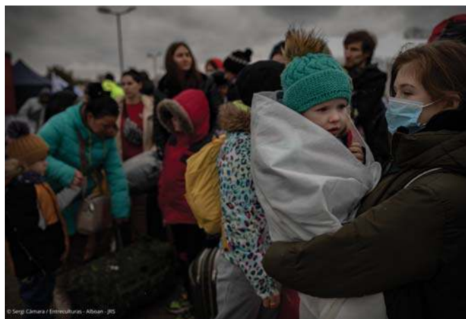
Ukrainian refugees arrive in Poland.

https://www.canadianjesuitsinternational.ca/ukraine-humanitarian-response/