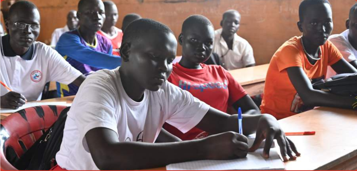
Students at the Mazzolari Teacher Training College.