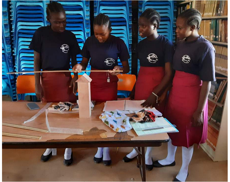
Students at Loyola Secondary School.

CJI has supported the Jesuits of Eastern Africa Province's Sowing Seeds of Transformation project for years.