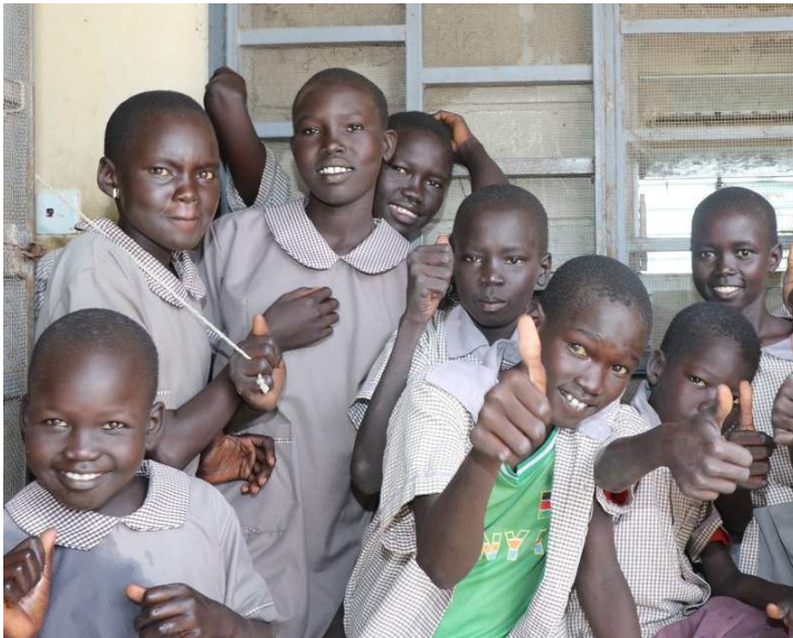
Primary school students.

Its programs have helped thousands of people. In addition to primary and secondary education, AOR also offers vocational training, peace initiatives, and pastoral programs.