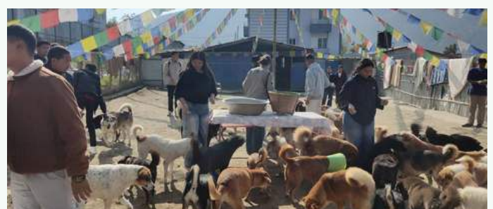
Community service day