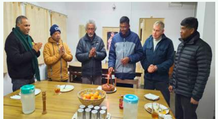
NJSI activities in villages, and birthday celebrations