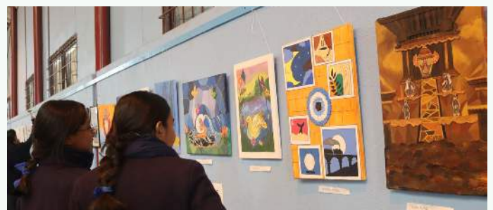
Joint School Art Exhibition