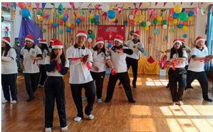
Christmas at SBK