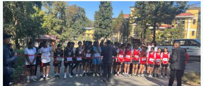
Cross Country Race at KUHS