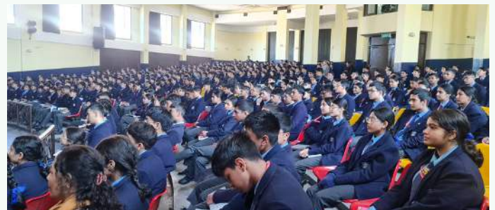
Motivational Talk Programme