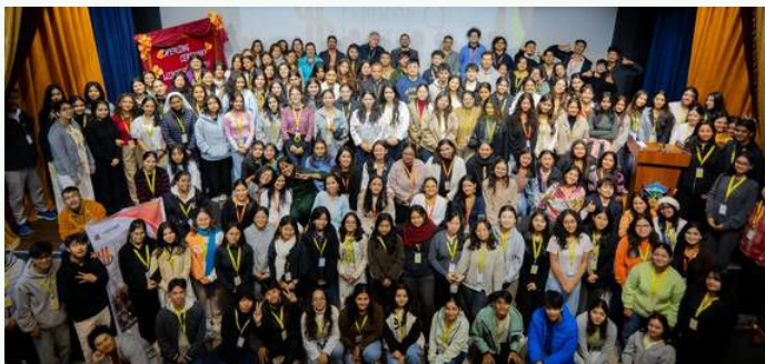
Winter Warmth Stage Presentation